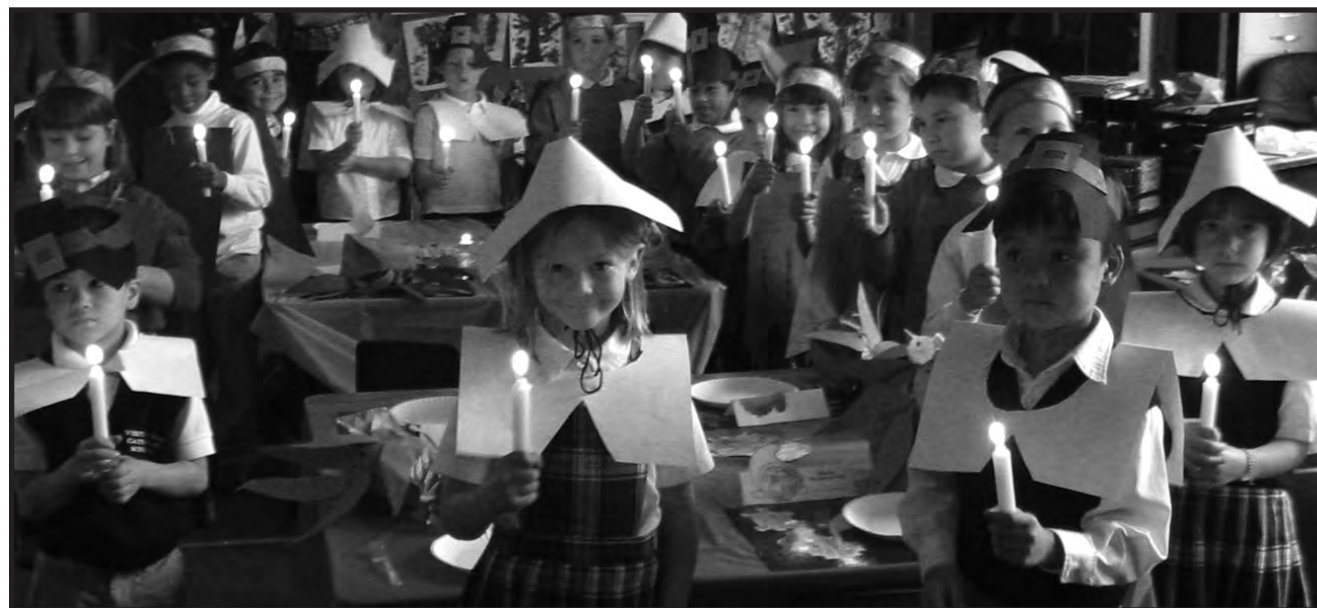
Let the little children come to me; do not stop them, for it is to such as those that the kingdom of God belongs. (Mark 10:14)