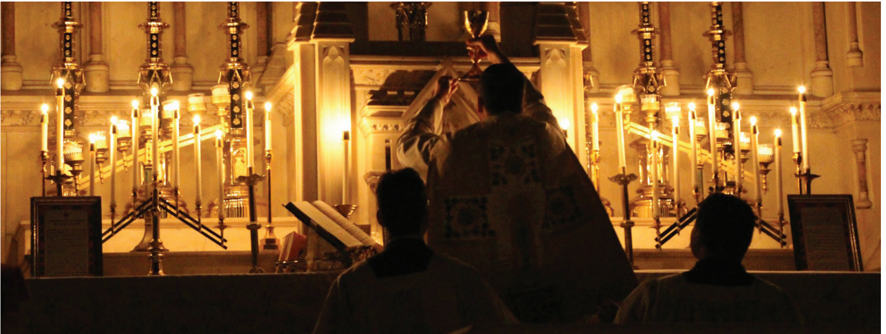
Photo: Rorate Mass at the Church of the Holy Innocents in New York City in 2016.

Solemn Votive Mass Rorate Cæli in honor of the Blessed Virgin Mary in Advent